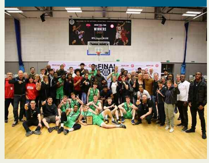
Basketball England's National Basketball League U18 Men's Playoff final saw Myerscough defeat Haringey Hawks 52-50 at the National Basketball Performance Centre in Manchester.

Meanwhile, Myerscough continued its dominance in the AoC Sport Premier Cup and Knockout Cup competitions, winning both for a third-straight year.