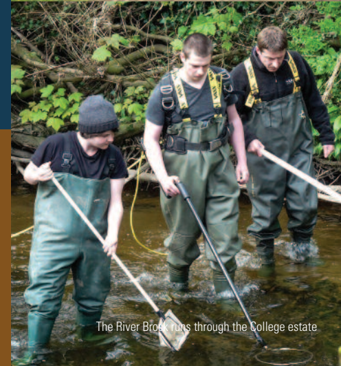
The River Brock runs through the College estate