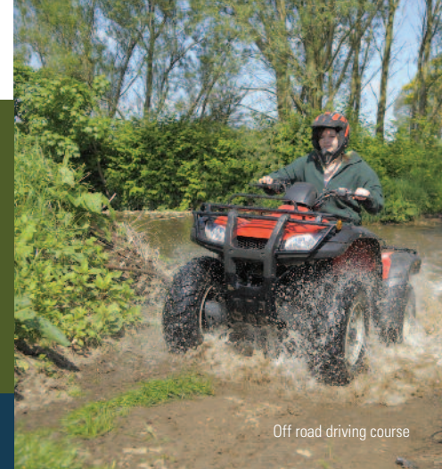
Off road driving course