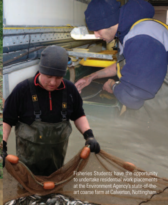
Fisheries Students have the opportunity to undertake residential work placements at the Environment Agency's state-of-the-art coarse farm at Calverton, Nottingham.